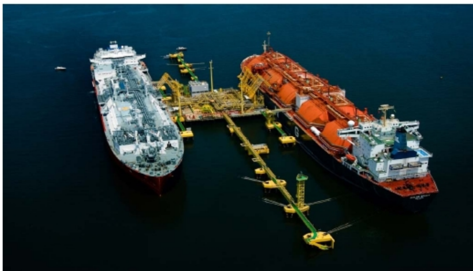
Golar Spirit FSRU receiving cargo from LNG Carrier in Guanabara Bay, Rio de Janeiro

projects. FSRU projects can typically be completed in less time (2 to 3 years compared to 4 or more years for land based projects) and at a significantly lower cost (20-50% less) than land based alternatives.