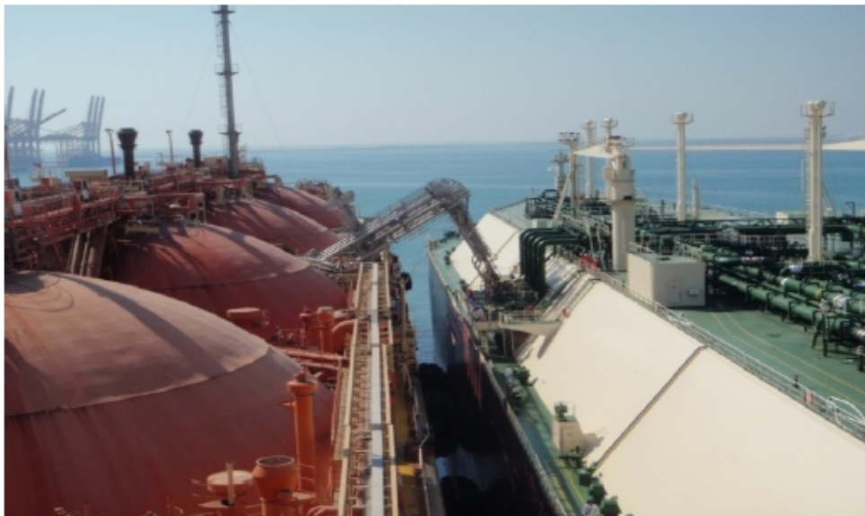
Golar FSRU, Golar Freeze, receiving cargo from Qatargas LNG Carrier in Dubai