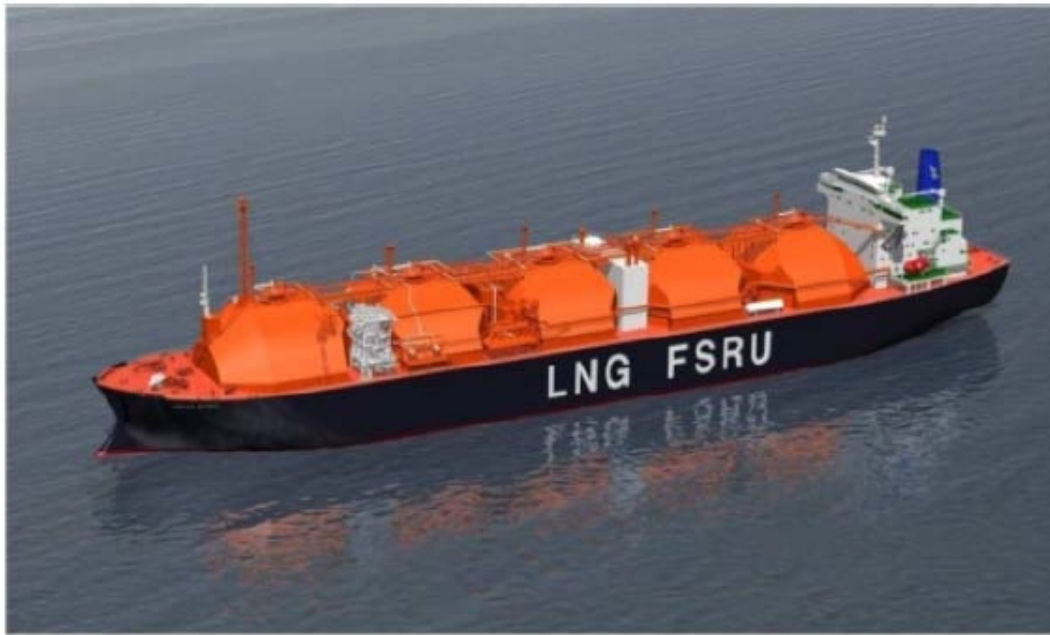
Artist's Rendition of Golar Spirit FSRU located in Brazil.

The FSRU regasification process involves the vaporization of LNG and pressurising and injection of the natural gas directly into a pipeline. In order to regasify LNG, FSRUs are equipped with vaporizer systems that can operate in an open-loop mode, a closed-loop mode, or in both modes. In the open-loop mode, seawater is pumped through the system to provide the heat necessary to convert the LNG to the vapor phase. In the closed-loop system, a natural gas-fired boiler is used to heat water that is circulated in a closed-loop through the vaporizer and a steam heater to convert the LNG to the vapor phase. In general, FSRUs can be divided into four subcategories: